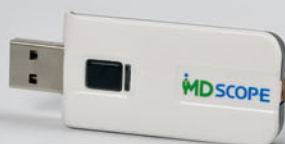
MDscope image dongle for MAC / PC system