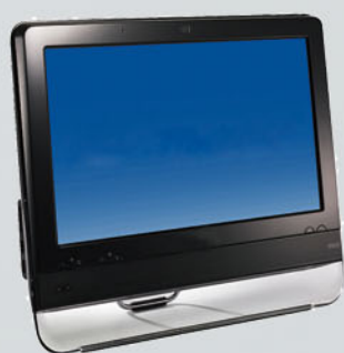
monitor / TV

Video port to provide simultaneous image to TV/ monitor, or to download image to Mac / PC system.